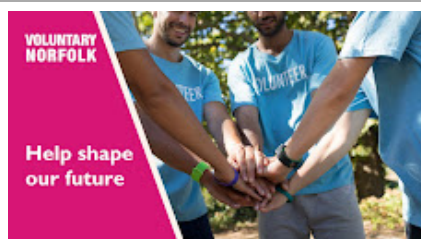
Voluntary Norfolk Social Media Asset.jpg 166K

Voluntary Norfolk welcomes feedback (good or bad). If you would like to acknowledge receipt of excellent service or feel that we did not meet your expectations, please complete our quick and easy online form so that we can share your feedback with the relevant team and staff members.